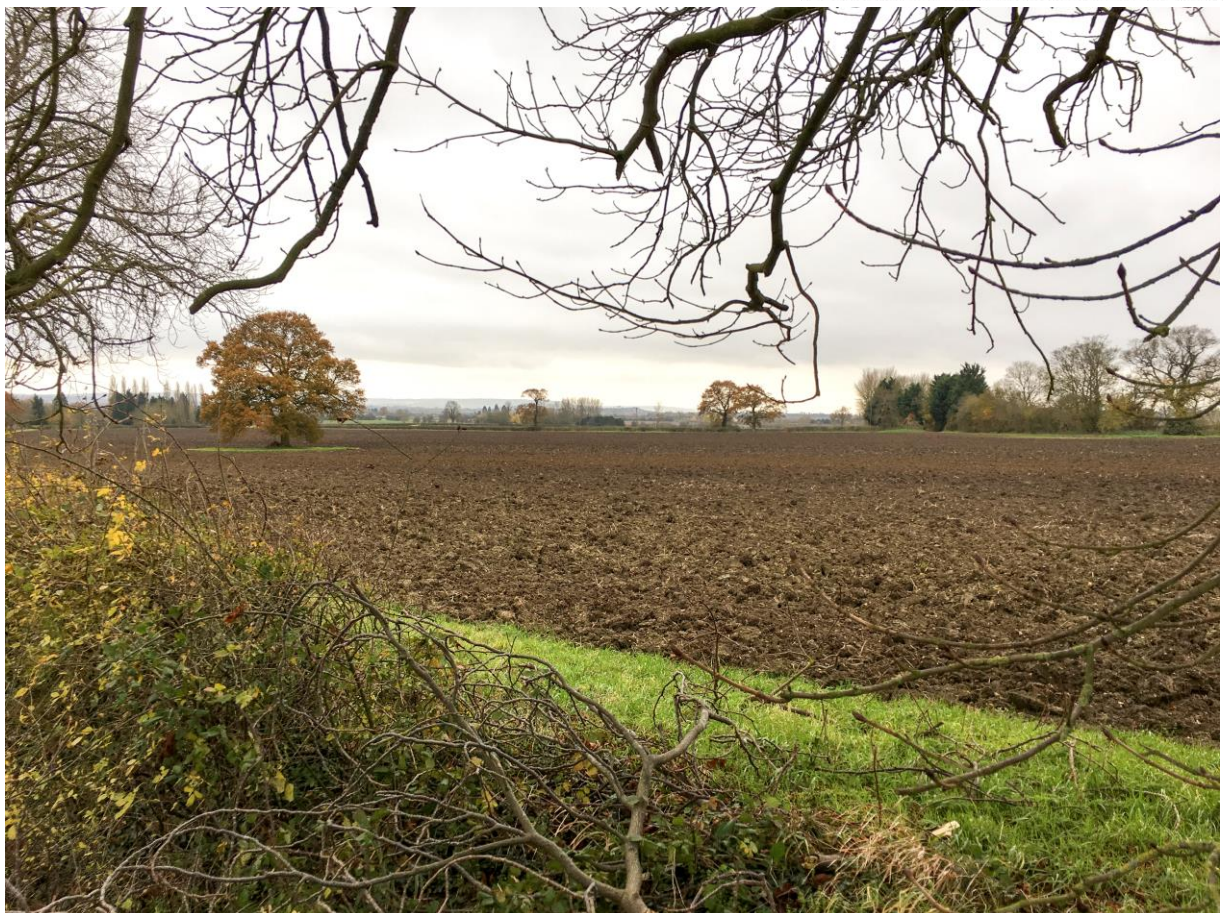
Looking south from Leighton Road in the north eastern corner of the site.