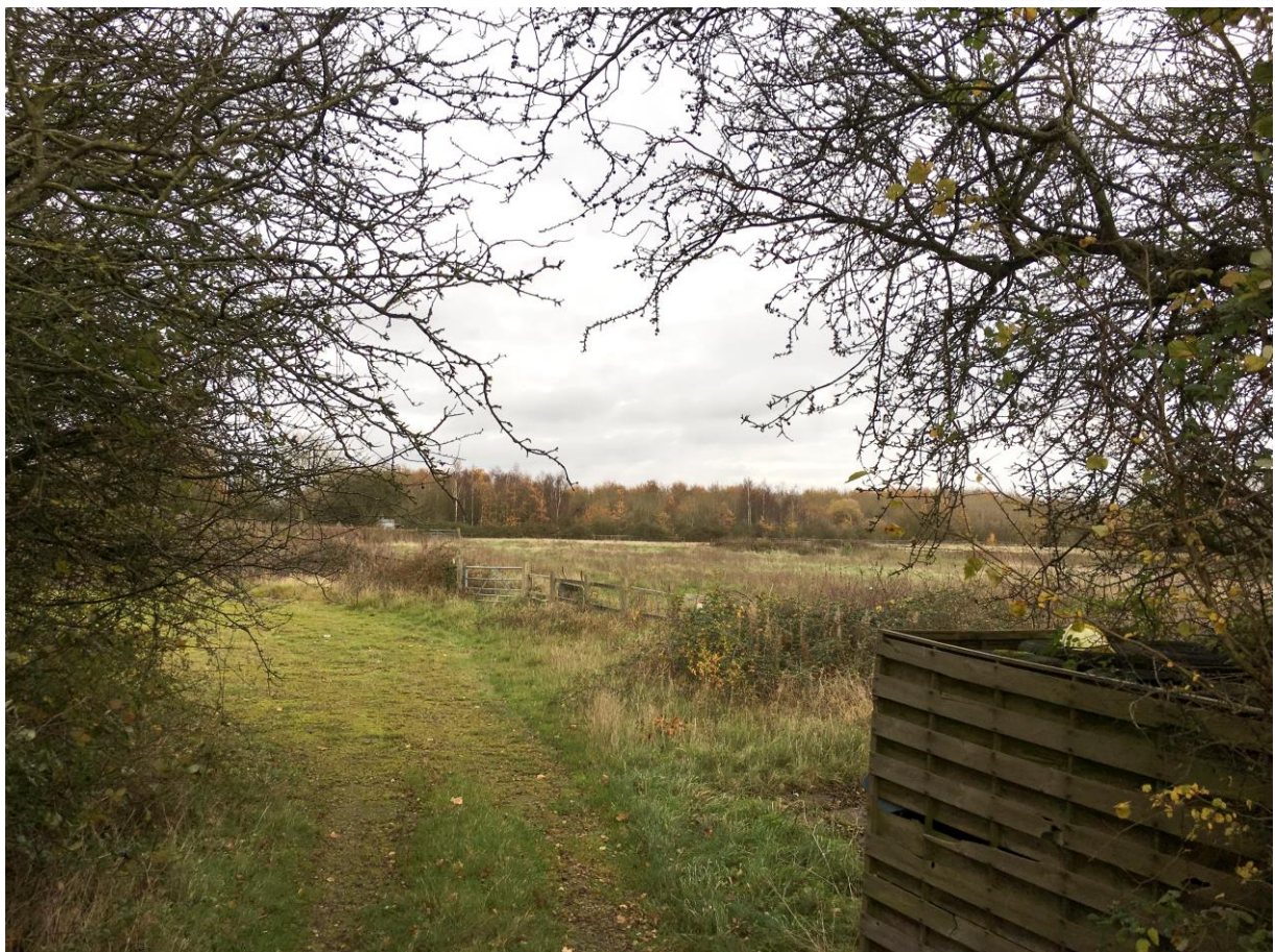
Looking north east towards Linslade Wood from Leighton Road.