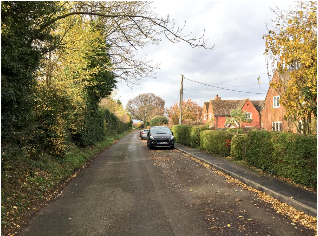
Looking north west along the northern boundary from Rectory Road.