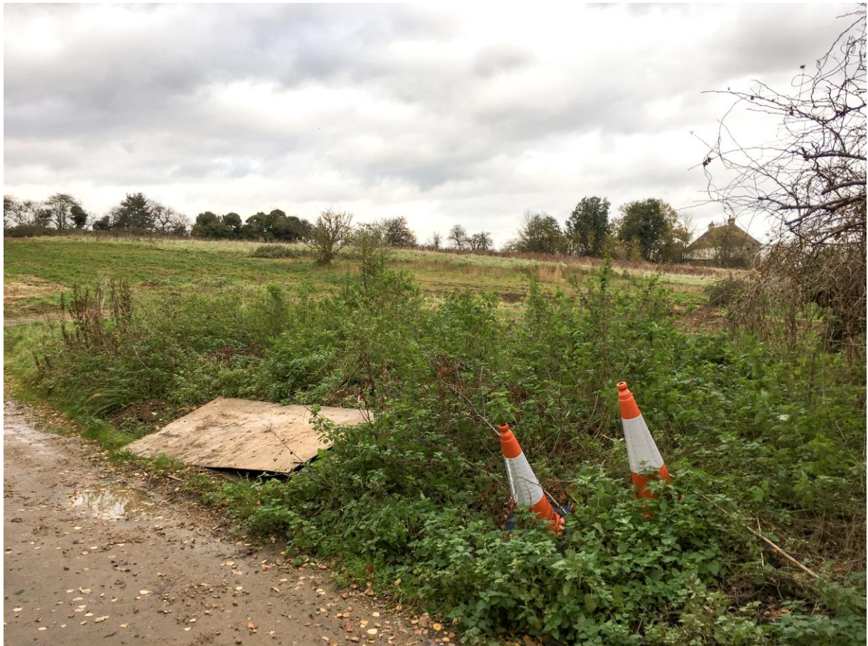
Looking north east from the High Street.